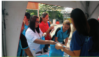
Booth registry for LARC giveaways at the Pinya Festival 2019

Calauan, Laguna claiming their local product as the sweetest in the Philippines, created a festival using their most prized crop, the pineapple or Pinya in Filipino. The Pinya festival serves as the highlight of the town's celebration of the