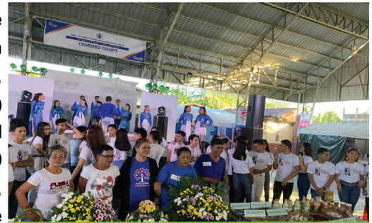
Mayondon residents present local products during the Dalaktik Festival

LARC joined the first Mayon-Doon Dalaktik (Isda, Bulaklak, Itik) Festival last April 28 - May 5, 2019 held at Mayondon, Los Banos. The festival primarily