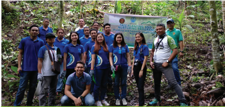
Several LARC and MCME employees visit the MMFR area to conduct plant maintenance to commemorate Arbor Day 2019.

"Plant a tree, save our watershed." LARC employee volunteers together with Makiling Center for Mountain Ecosystem (MCME) celebrated Arbor Day last June 26, 2019 by conducting brushing and fertilizer application on the seedlings that were planted last year at Mt. Makiling Forest Reserve (MMFR) Area. The activity is under LARC's 3-year partnership with MCME and the University of the Philippines Los Banos Foundation Inc. (UPLBFI), dubbed as the "Tree Planting and Nurturing" program, through a memorandum of agreement. It is also aligned with the objective of LARC's Dalayday program to promote environment protection within the service area.