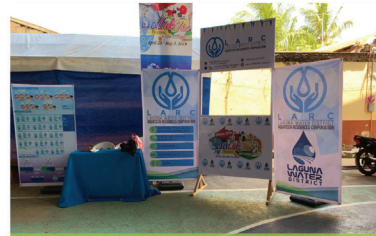
LARC sets up water station at the first-ever Dalaktik Festival

aims to showcase the barangay's products and focal livelihood in celebration of the collective effort of the community. LARC bottled water were distributed by the barangay during the parade, water stations were set up by LARC during several of its events, and a LARC photobooth was set up where festival goers were free to take their souvenirs photos.