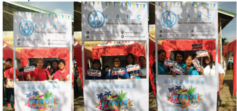
LARC joins the Pinya Festival Celebration by giving away LARC souvenirs to visitors.

feast of San Isidro Labrador. The festivity that started on May 9 until May 15, 2019 was joined by LARC employees. LARC has a designated booth in the heart of the celebration for fiesta goers filled with various activities. Aside from LARC giveaways, they also had the chance to inquire about their water service concerns and the opportunity to take souvenir photos in the LARC photobooth.