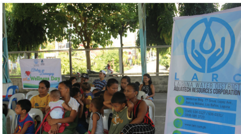
Mothers from Bryg. Anos bring their children for the free medical check-up brought by LARC.

successfully conducted at Barangay Anos Multi-Purpose Covered Court with the help of its barangay officials, Barangay Nutrition Scholars and Barangay Health Workers. LARC reached residents of the barangay to provide free medical consultations, medications, dental check-up, and tooth extraction. Select volunteer medical doctors provided the free medical assistance while volunteer dentists provided free tooth examination and extraction to the residents. Some of the kids also watched a video on proper hand washing techniques and received hygiene kits. Almost hundred individuals benefited from the said activity.