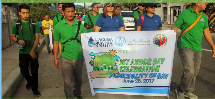
Employees of LARC and LWD actively participate in the parade for the Municipality of Bay, Laguna's celebration of 1st Arbor Day on Wednesday, June 28, 2017.

Last June 28, 2017, Laguna Water District Aquatech Resources Corporation (LARC) participated in the very first Arbor Day celebration in Bay, Laguna. Together with Laguna Water District (LWD) and the Municipality of Bay, LARC joined in the tree planting activity and parade.