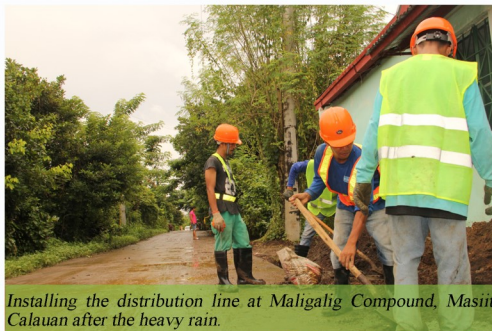
Installing the distribution line at Maligalig Compound, Masiit, Calauan after the heavy rain.

LARC completed a couple of projects this quarter to upgrade and extend parts of its water system in Sitio Ibaba, Sto. Domingo, Bay and Kalye Putol, Masiit, Calauan. Two more distribution lines at Calauan, namely Sitio Anscor, Mabacan and Maligalig Compound, Masiit, are ongoing. These projects are included in the series of improvements that LARC has planned for this year. Around 300 households in Bay and Calauan are expected to benefit from these improvements.