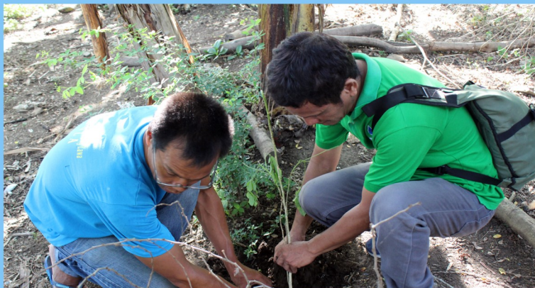
LWD employees plant kakawate seedling during tree planting activity on the 1st Arbor Day Celebration at the Brgy. San Isidro, Bay, Laguna on Wednesday, June 28, 2017.