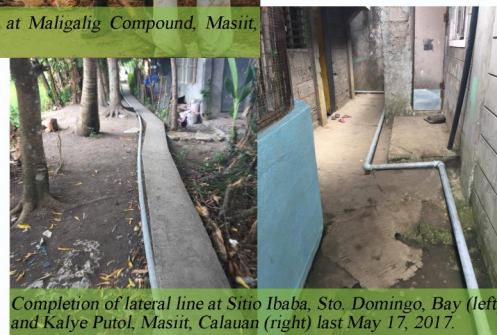
Completion of lateral line at Sitio Ibaba, Sto. Domingo, Bay (left) and Kalye Putol, Masiit, Calauan (right) last May 17, 2017.