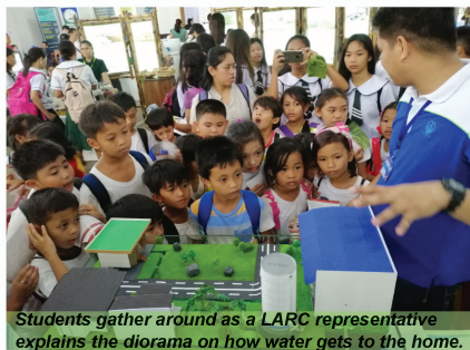
Students gather around as a LARC representative explains the diorama on how water gets to the home.

Overall, the three-day celebration of the National Science and Technology Week in Los Baños from August 28 to August 30, 2019 with the theme "Enabling technologies for sustainable development" was a great success.