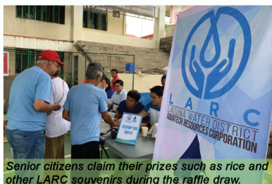
Senior citizens claim their prizes such as rice and other LARC souvenirs during the raffle draw.