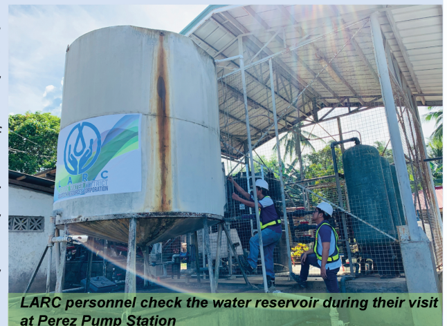
LARC personnel check the water reservoir during their visit at Perez Pump Station

The increase in water supply consequently enhanced water availability and water pressure in the area. The boost in water supply will also allow LARC to bring potable water especially to elevated areas, which previously had limited water supply availability particularly in Perez and Paliparan at Calauan.