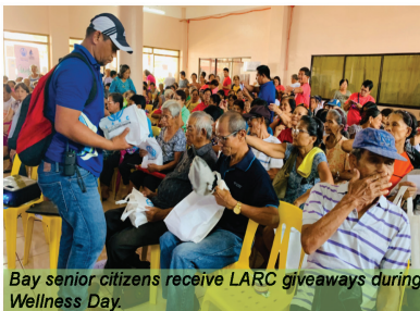
Bay senior citizens receive LARC giveaways during Wellness Day.