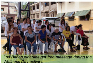
Los Baños elderly get free massage during the Wellness Day activity.

Senior Citizens' Wellness Day at Chipeco Bldg., Municipal Hall, Bay, Laguna