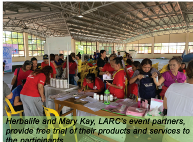
Herbalife and Mary Kay, LARC's event partners, provide free trial of their products and services to the participants.

Women's Wellness Day at Chipeco Bldg., Municipal Hall, Bay, Laguna