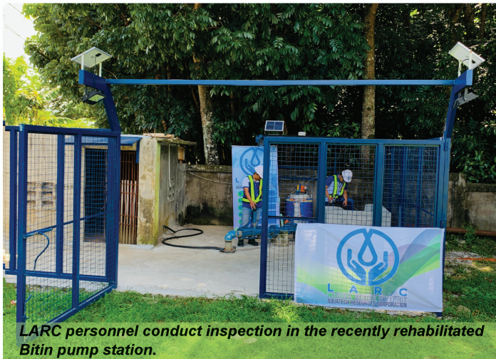
LARC personnel conduct inspection in the recently rehabilitated Bitin pump station.

Laguna Water District Aquatech Resources Corporation (LARC) recently upgraded Bitin Pump Station to ensure adequate water source and water supply system in Bitin, Bay and its surrounding areas. The upgrade of Bitin Pump Station increased the water being supplied in the area from 52 cubic meters per hour to 70 cubic meters per hour. The additional 18 cubic meters of water means more households in the service area can have water supply from LARC.