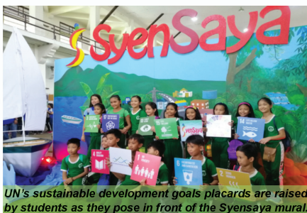
UN's sustainable development goals placards are raised by students as they pose in front of the Syensaya mural.

Laguna Water District Aquatech Resources Corporation (LARC) spearheaded the 3-day Wonderama Exhibit of the Los Baños Science Community Foundation, Inc. (LBSCFI), an activity during the Los Baños Science Festival or Syensaya as popularly called.