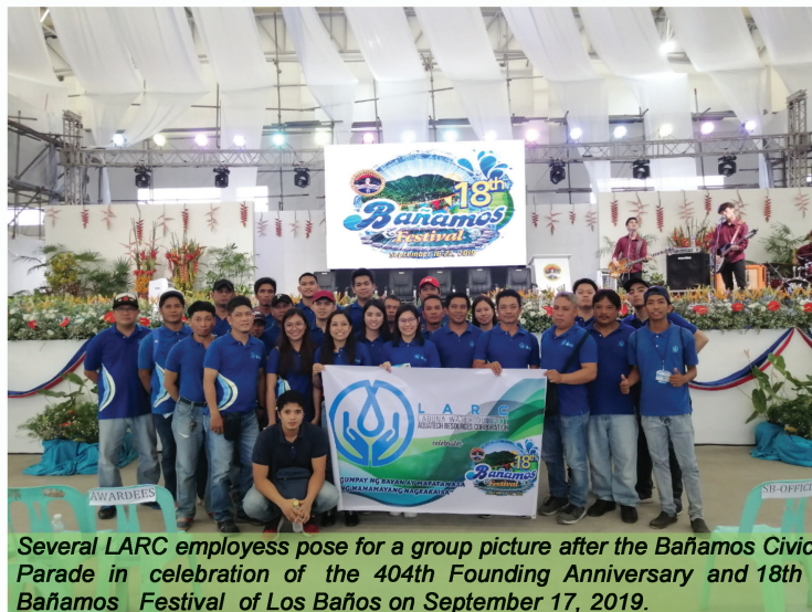
Several LARC employees pose for a group picture after the Baños Civic Parade in celebration of the 404th Founding Anniversary and 18th Baños Festival of Los Baños on September 17, 2019.