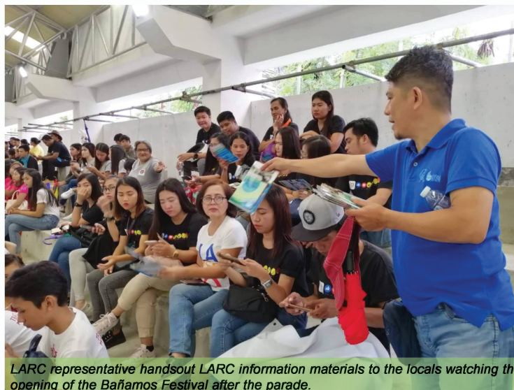
LARC representative handsout LARC information materials to the locals watching the opening of the Baños Festival after the parade.