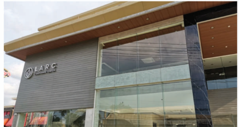
LARC building's improved look located in Km. 65, Manila South rd., Maahas, Los Banos.

Should you have any questions on the relocation, please feel free to contact us through LARC official Facebook page or at 5364127 loc 101, 108, 109. We look forward to seeing and serving you at our new and better facility.