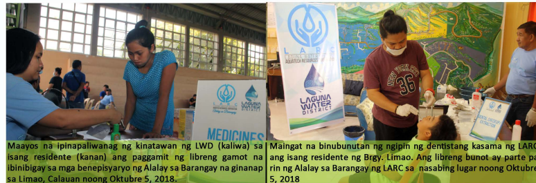
Maayos na ipinapaliwanag ng kinatawan ng LWD (kaliwa) sa isang residente (kanan) ang paggamit ng libreng gamot na ibinibigay sa mga benepisaryo ng Alalay sa Barangay na ginanap sa Limao, Calauan noong Oktubre 5, 2018.