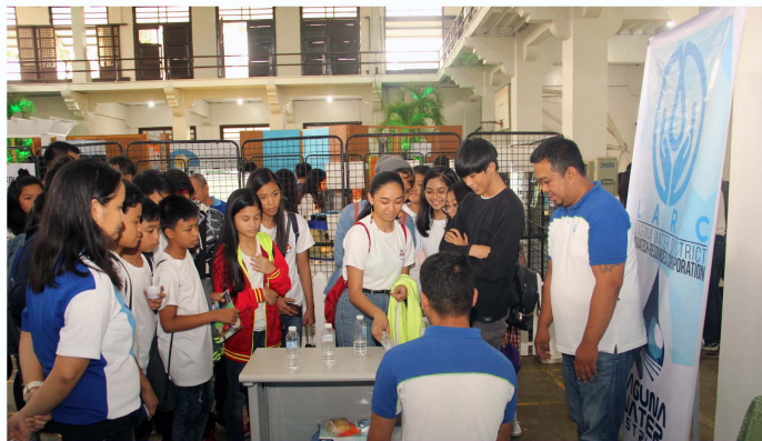
Masigasig na lumahok ang mga bumisitang mag-aaral sa palaro ng LARC sa Wonderama exhibit.

Lumahok ang Laguna Water District Aquatech Resources Corporation (LARC) sa tulong ng Laguna Water District (LWD) sa ginanap na Wonderama Exhibit ng Los Banos Science Community Foundation Inc. (LBSCFI). Ito ay ginanap noong Syensaya Festival na nagsimula noong Nobyembre 7 hanggang Nobyembre 9, 2018 sa Baker Hall, Unibersidad ng Pilipinas sa Los Banos. Ang tema ng exhibit para sa taong ito ay "Syensya para sa tao: pagbabago para sa pangkalahatang kaunlaran."