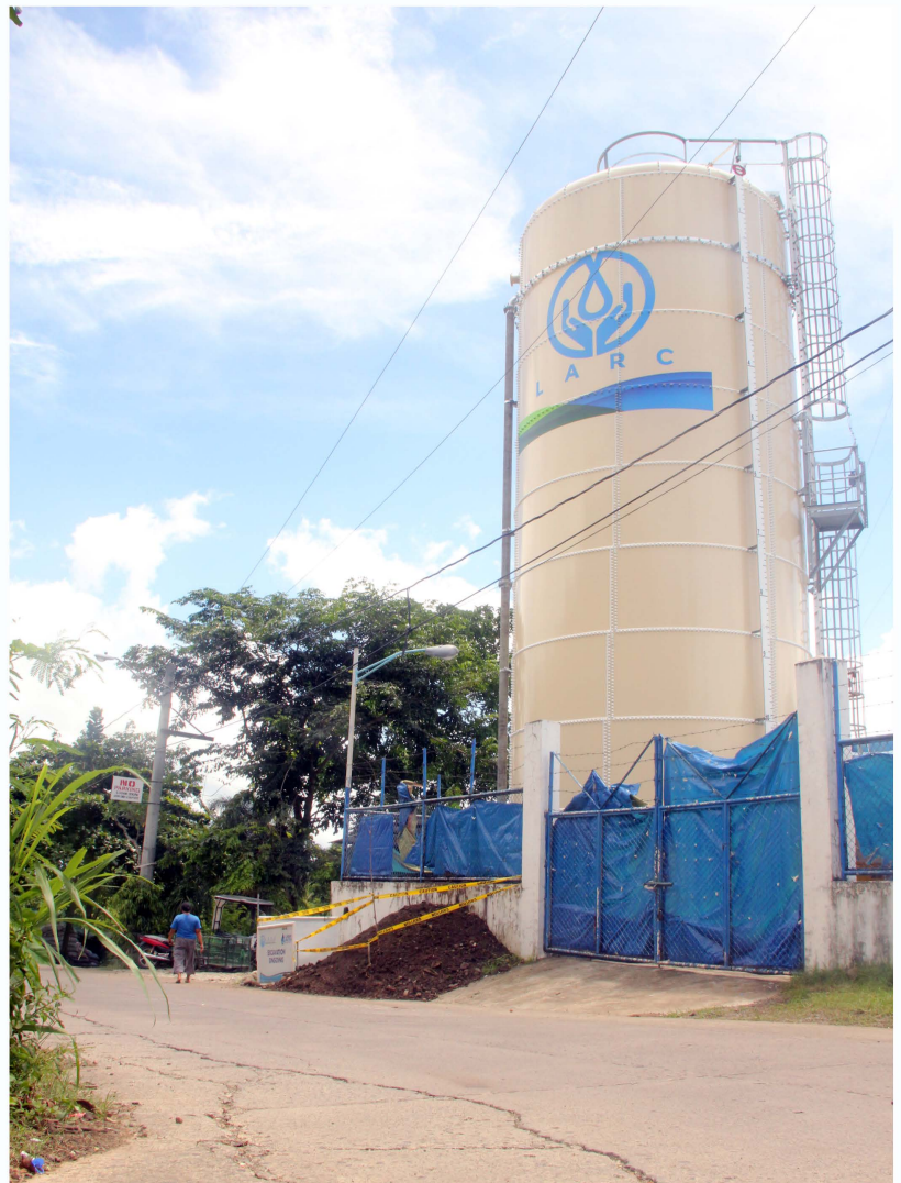
LARC's recently completed water reservoir is located at Kanluran, Bayog, Los Baños, Laguna.

The two new reservoirs will add to LARC's five existing reservoirs located in strategic locations throughout its concession area.