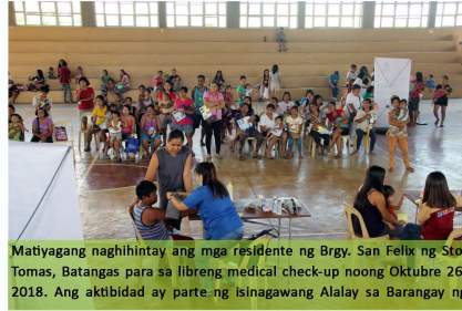
Matiyagang naghintay ang mga residente ng Brgy. San Felix ng Sto. Tomas, Batangas para sa libreng medical check-up noong Oktubre 26, 2018. Ang aktibidad ay parte ng isinagawang Alalay sa Barangay ng

Muling nagsagawa ang Laguna Water District Aquatech Resources Corporation (LARC), kasama ang Laguna Water District (LWD) katuwang ang lokal na pamahalaan ng mga barangay ng libreng