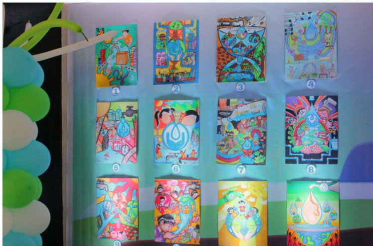
The top 12 posters created by the students from various elementary schools show the contestants' take on the importance of water security for the next generation.

An exhibit was launched at the lobby of the LARC Main Office that featured the company's projects and developments as a way to apprise our concessionaires of our achievements for the year. These achievements include corporate social responsibility initiatives and other projects to improve the efficiency and the reliability of the water supply system.