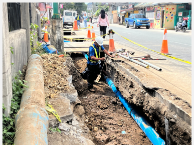
LARC employees conduct the tapping activity at Lopez Avenue, Los Baños for the relocation of mainline in coordination with DPWH.

LARC relocated portions of the mainline along Lopez Avenue in Barangay Batong Malake, Los Baños as part of the drainage construction project of Department of Public Works and Highways (DPWH) in the area, which started in February. As of March 31, 2023, 270 meters, or half of the target line, had been relocated out of 510 meters. According to DPWH, the target completion of the project is on April 30, 2023.