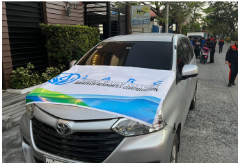
Pakikiisa ng LARC sa isinagawang motorcade ng BFP Los Baños noong ika- 3 ng Marso.

Ang Laguna Water District Aquatech Resources Corporation (LARC) ay nakiisa sa isinagawang motorcade sa pangunguna ng Bureau of Fire Protection – Los Baños (BFP-LB) sa pagsisimula ng Fire Prevention Month na dinaluhan ng iba't ibang ahensya ng Los Baños. Ang Fire Prevention Month ay ipinagdiriwang tuwing Marso at ngayong taon, ito ay may temang “Sa pag-iwas sa sunog, hindi ka nag-iisa.”