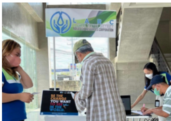
Customers join LARC WWD 2023 celebration after paying their water bills.

LARC joins the celebration of World Water Day (WWD) on March 22 with the theme "accelerating the change to solve the water and sanitation crisis". World Water Day is an annual celebration to raise awareness and call for action to tackle the water and sanitation crises worldwide.