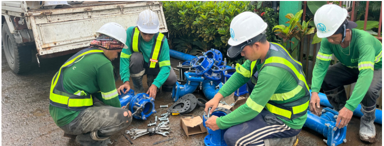
LARC employees transferring Mabacan pipe line's source to Lamot 2 Pump Station.

Barangay Mabacan, Calauan residents being supplied by LARC water are now experiencing improved supply and pressure. This is made possible by transferring the water source of distribution lines from Jubileeville Pump Station to Lamot 2 Pump Station, which is essential for proper monitoring of billed volume, production, and non-revenue water. The activity was completed on January 4, 2023. Households in Mabacan and Masaya benefit from the said projects, as the water pressure in both barangays is expected to improve due to the transfer.