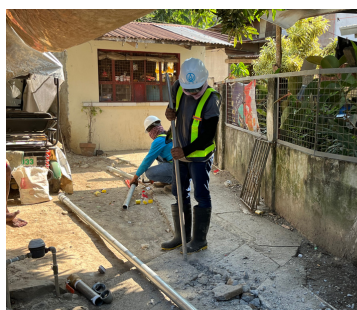
Lateral line upsizing in Purok 3, Barangay Tuntungin Putho in Los Baños.

Households in parts of Bay and Tuntungin Putho in Los Baños experienced water interruptions from March 29 to March 30 due to electromechanical facility replacement at Jubileeville Pump Station. The replacement was done to improve the water supply and pressure in the areas supplied by the said pump station.